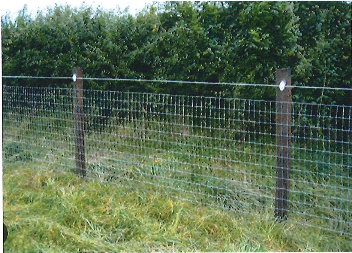
Example of Fencing: